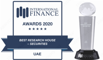
Best Research House in UAE 2016 and 2020 by "IFA"