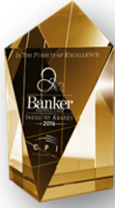
Best Brokerage House in UAE 2016 & 2017 by "Banker Middle East"